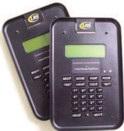
Electronic Comment Card survey trays.